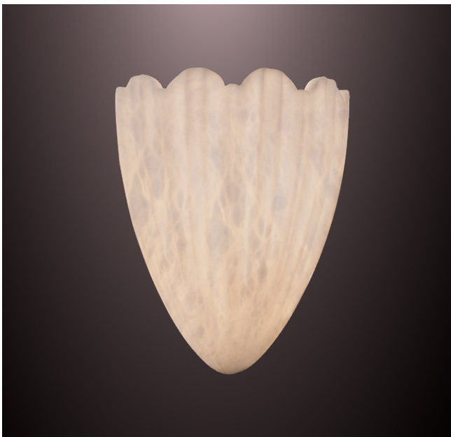
Pictured with soft white 2700K bulb