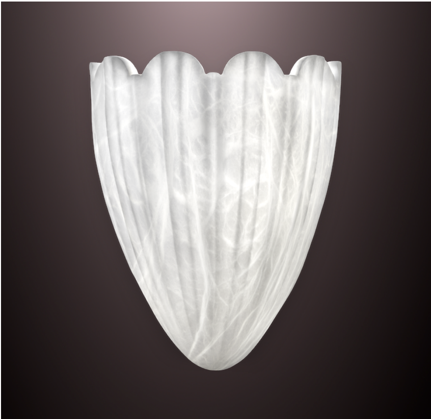
Pictured with daylight 5000K bulb