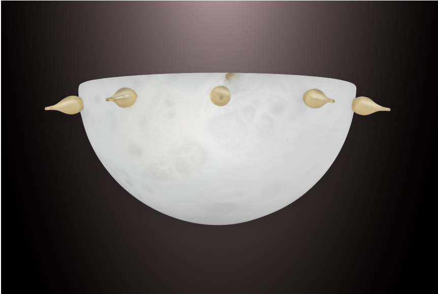
Pictured in satin brass with daylight 5000K bulb