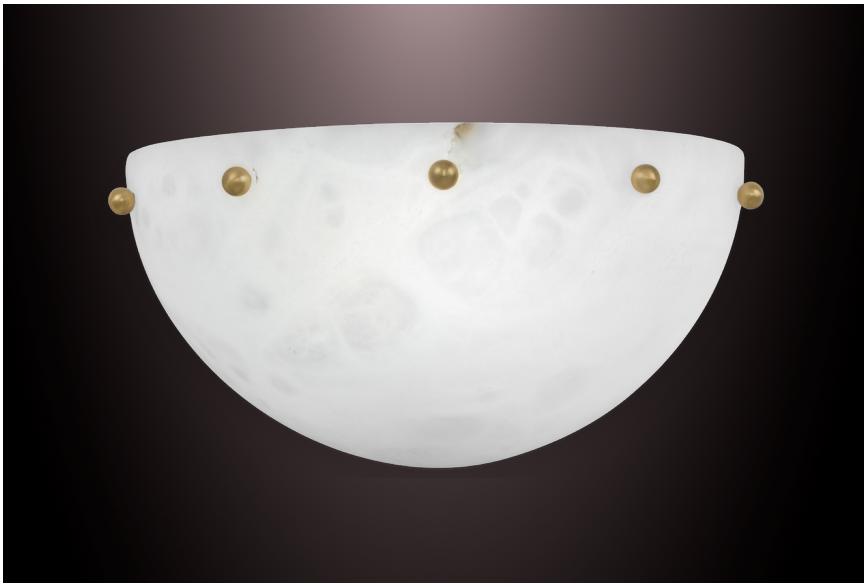
Pictured in satin brass with daylight 5000K bulb